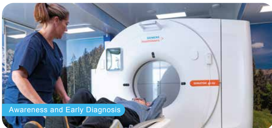
Awareness and Early Diagnosis

The NHS Targeted Lung Health Check screening programme in Humber and North Yorkshire has received additional funding of £1,135,429 from NHS England to purchase a second mobile CT scanning unit.